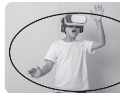
Virtual Reality (VR)