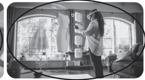
Augmented Reality (AR)