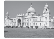
Victoria Memorial- Kolkata