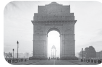
India Gate- New Delhi