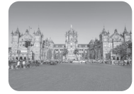
Chhatrapati Shivaji Maharaj Terminus- Mumbai